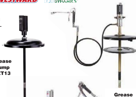
Grease Pump with Gun 3APE8