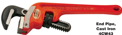
End Pipe, Cast Iron 4CW43