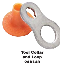
Tool Collar and Loop 24AL49