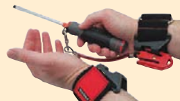
Easy hands-free tool transfer

When working at heights, it's imperative to secure hand tools to a fixed point to prevent injuries caused by dropping. Proto® SkyHook™ Tether and Transfer systems provide positive control of hand tools at height, secure tool transfers, and a free range of motion. SkyHook™ switch connector tethers to the tool on a short lanyard and is compatible with screw-gate carabiners. Allows hands-free tool transfer. SkyDock™ attachment anchors SkyHook connector to the wrist, belt, apron, or station. Tools can be tethered with shrink loops, tool collars, lanyards, or bungees for use with the system.