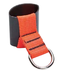
Heat Shrink Loop 24AL55