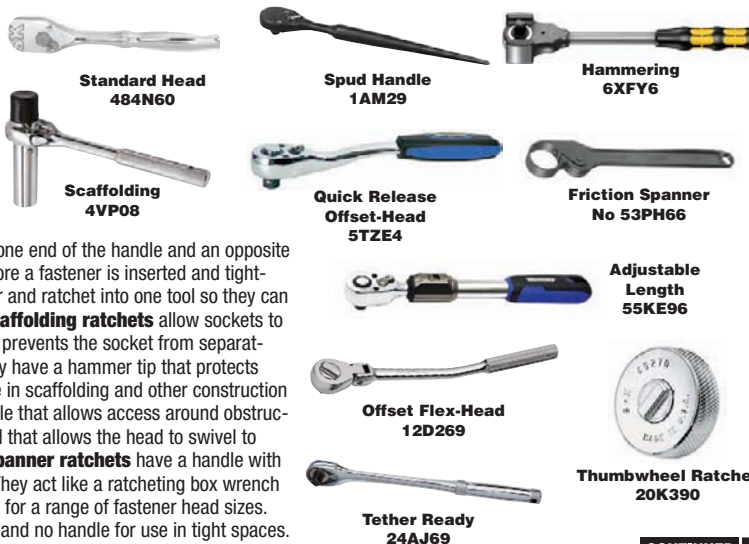
Standard Head 484N60

Standard-head spud handle ratchets have a ratchet head on one end of the handle and an opposite end that is tapered to ease the alignment of lugs or drill holes before a fastener is inserted and tightened. Standard-head hammering ratchets combine a hammer and ratchet into one tool so they can be used to strike surfaces and turn fasteners. Standard-head scaffolding ratchets allow sockets to be connected to the drive with a through-hole and pin design that prevents the socket from separating from the ratchet even when the tool is used as a hammer. They have a hammer tip that protects fasteners from damage when struck. Ratchets are suitable for use in scaffolding and other construction applications. Offset flex-head ratchets have a bend in the handle that allows access around obstructions to reach fasteners. They come with a hinge close to the head that allows the head to swivel to access fasteners from multiple angles in tight spaces. Friction spanner ratchets have a handle with one end that accepts an insert ring sized to the desired fastener. They act like a ratcheting box wrench except the spanner tool is compatible with a variety of insert rings for a range of fastener head sizes. Thumbwheel ratchets are small size ratchets with a drive head and no handle for use in tight spaces. They can be rotated in the palm of the hand or with a thumb to tighten or loosen fasteners.