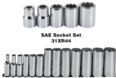
SAE Socket Set 31XR44