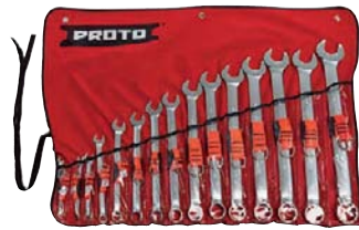
SAE, 12-Point Tether-Ready 24AJ70