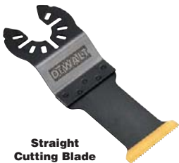
Straight Cutting Blade 49JP75