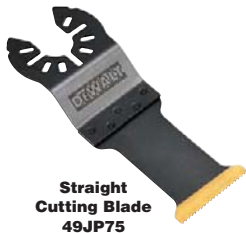
Straight Cutting Blade 49JP75