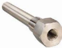
Temp. Regulators and Duct Sensors 6CUF3