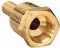
Stepped Shank 20JN92

Stainless steel is the most widely used thermowell material. Stainless steel is heat- and corrosion-resistant. Low-lead compliant brass thermowells are used for contact with potable water.