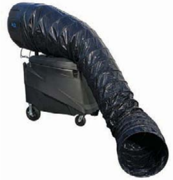
55MU73 Ducting Only