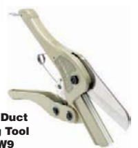
Wiring Duct Cutting Tool 2ETW9