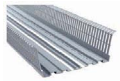
Corner One-Piece Slotted Wiring Ducts 1LEP6