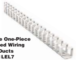
Flexible One-Piece Slotted Wiring Ducts 1LEL7