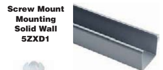
Screw Mounting Solid Wall 5ZXD1