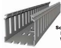
Screw Mounting Wide Slot 53UH84

Troughs route and organize short runs of wire and cable in tight spaces. They provide a neat appearance for wiring and allow for configuration changes. They often have fingers on the sides that create slots for cables to be added, removed, or rerouted. Wiring ducts are commonly mounted inside electrical enclosures, control panels, and machines.