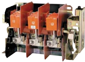
Disconnect Switch 4B983