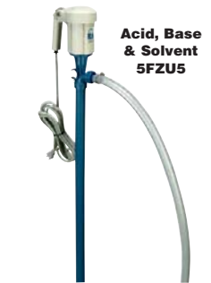
Acid, Base & Solvent 5FZU5