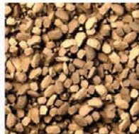
Corn Cob 2MVR4