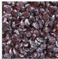
Aluminum Oxide 6YY34