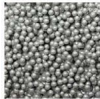
Glass Beads 2W580