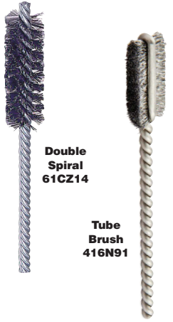
Double Spiral 61CZ14