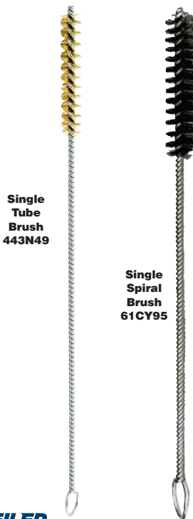
Single Tube Brush 443N49