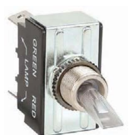
Lighted Toggle 3HZ81