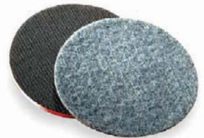
Hook and Loop Disc