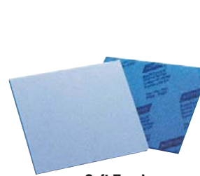
Soft Touch 1RDW8