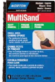
General Purpose 1RDV8

Softback —Coated on one side with an aluminum oxide grit that is excellent for automotive applications, this flexible sponge is effective for hard-to-reach areas like headlight openings and door jambs. The soft foam backing allows comfortable hand sanding.