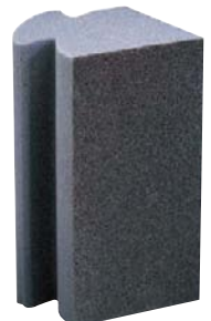
Corner Drywall 1PW39