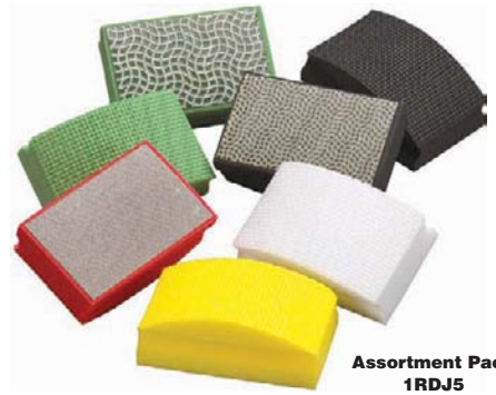
Assortment Pack 1RDJ5