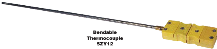
Bendable Thermocouple 5ZY12