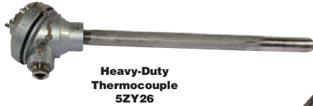
Heavy-Duty Thermocouple 5ZY26