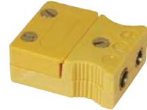
Standard Jack 5ZY34