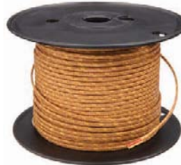
Thermocouple Wire 3AGF4