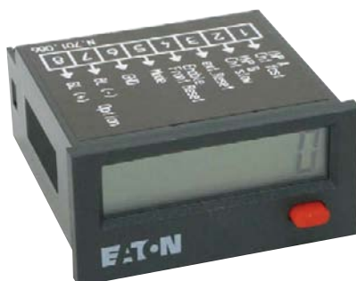
E5 Series 2RET4

Encoders —Quadrature output signal provides extremely accurate position indication, ensuring that count is correct regardless of which direction the shaft is rotating. ABEC 3 double-sealed ball bearings keep foreign matter out. Housing is sealed against dust, oil, vapor, and moisture.