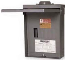
NEMA 3R 1D520