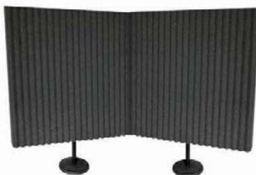
Portable Screens 19MP55