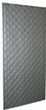
Wall Blanket 5T498

Decorative Fabric Panels —Ready-to-mount panels feature fabric-covered 6- to 7-lb. density fiberglass core that provides maximum noise absorption. Mount easily to walls, partitions, or any flat surface.