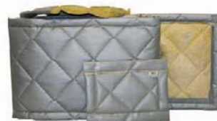
Quilted Absorber Roll 1VDL9