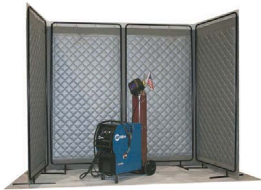
Portable Screen—4 Screens Shown (Sold individually.) 5T512