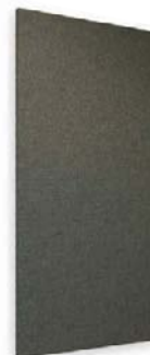
Decorative Fabric Panel 4RC06