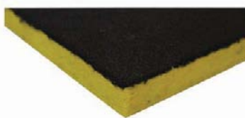
Acoustical Ceiling Tile 420T48