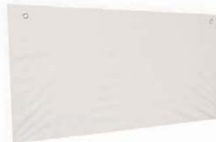
Overhead Sound Baffle 3TPT6