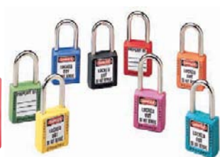
3LTP2 (Padlocks Sold Separately)