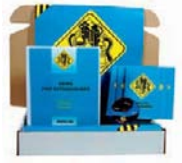
DVD Kit 6GWH3