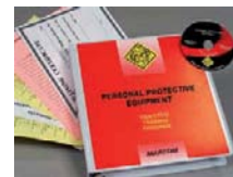
DVD Program 6GWP9