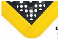
Grit Drainage Mat Kit 168X02

■ 5/8 in thick The F.I.T (Functional Interlocking Tiles) antifatigue and drainage mat system has square tiles that lock together to customize coverage over large or irregularly shaped areas. The locking system prevents tiles from separating over uneven floors and when moved or rolled up for cleaning. Standardized connections allow different tile types (antifatigue and drainage) to be connected in the same configuration. Beveled edging can be added as needed. Full tiles can be cut and reconnected in 3" intervals. Single tiles are replaceable.