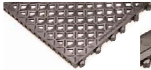
Diamond Grid Drainage Tile 33VL84