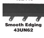
Smooth Edging 43UN62