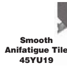
Smooth Antifatigue Tile 45YU19