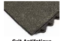
Grit Antifatigue Mat Tile 3LDA2