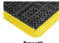
Smooth Drainage Mat Kit 48Z448