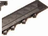
Diamond Grid Male Edging with Corner 33VM03