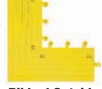
Ribbed Outside Corner 2RPR6