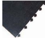
Smooth Antifatigue Tile 48ZU31