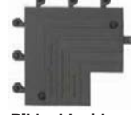
Ribbed Inside Corner 43UN92