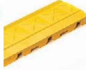
Diamond Grid Female Edging 33VL86