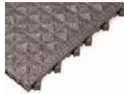
Diamond Grid with Grit Antifatigue Tile 33VL82