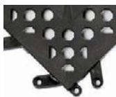
Smooth Drainage Mat Tile 4CKN9