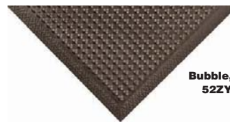
Bubble, Soft 52ZY13