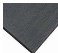
Ribbed, Soft 5Z056