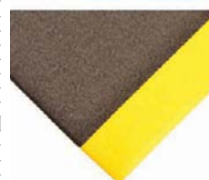
Pebble, Soft 52ZY07