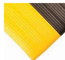
Ribbed, Super Soft 45WM02