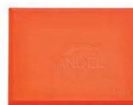
Smooth, Super-Soft 499A36