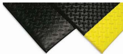
Diamond Plate, Soft 39R791 and 39R797