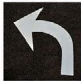
Improved Nighttime Visibility 49ZV94