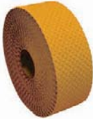
General Purpose 49ZV72