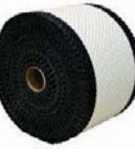
All Weather 49ZV51