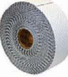
Improved Nighttime Visibility 49ZV53