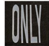
General Purpose 49ZW03