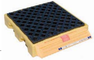
Plastic Spill Deck with Overflow Bladder 3VAR2