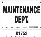
K1752 A, P, S (10 in x 14 in, 7 in x 10 in)