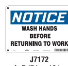
J7172 A, P (7 in x 10 in, 10 in x 14 in) S (5 in x 7 in, 7 in x 10 in, 10 in x 14 in)