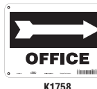
K1758 A, P, S (10 in x 14 in, 7 in x 10 in)