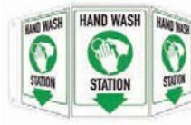
484M94 A (10 in x 17 1/2 in)