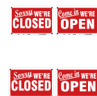
487D43 P (8 in x 12 in)