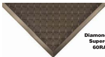
Diamond Grid, Super-Soft 60RA56