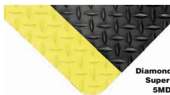
Diamond Plate, Super Soft 5MDE1