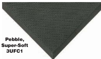
Pebble, Super-Soft 3UFC1