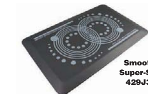
Smooth, Super-Soft 429J33