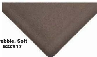
Pebble, Soft 52ZY17