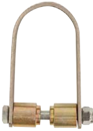
Cab Mount 16V474