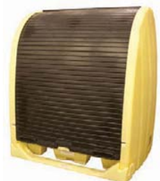
Rolltop Door 5VD51