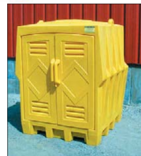
Spill Containment Hut 5PW03