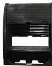
Rolltop Door 45YX90