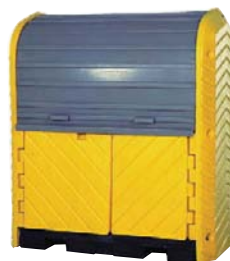
Rolltop & Double Doors 3FTY1

Hard-sided Plastic Spill Containment Hut with Double Doors —Stores up to four 55-gal. drums. It is constructed of high-density polyethylene and has four-way forklift pockets, vented doors, and removable grating and top hooks for moving.