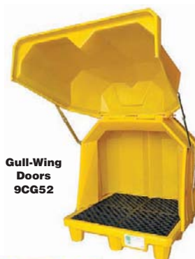
Gull-Wing Doors 9CG52