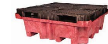
Pallet with Removable Sump 4LNU5