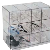
4GMR7 (Contents not included.)