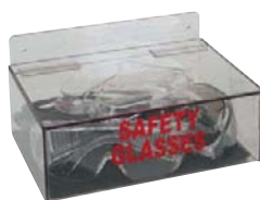
4GMR6 (Contents not included.)