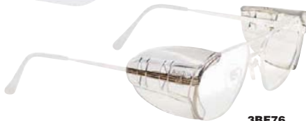
3BE76 (Eyewear Not Included)