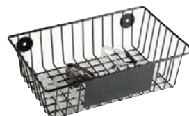
6GLD0 (Contents not included.)