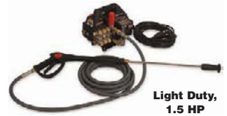
Light Duty, 1.5 HP 1TDK4

20KC14 features thermal overload protection, external bypass system, and totally enclosed powder-coated belt guard. Includes 50-ft. ⅜" nonmarking hose, insulated lance and trigger gun with safety lock, and 10-ft. power cord.