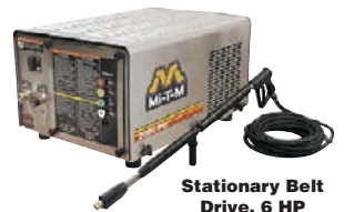
Stationary Belt Drive, 6 HP 3WB74