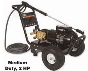
Medium Duty, 2 HP 3WB87