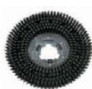
Polypropylene Bristles Black 30XJ26