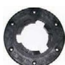
Clutch Plate 35PT44