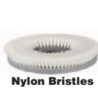
Nylon Bristles White 45NY86