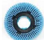
Abrasive Bristles Light Blue 54TP14