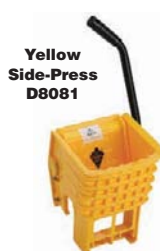
Yellow Side-Press D8081