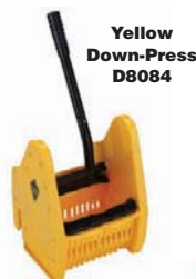
Yellow Down-Press D8084