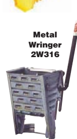
Metal Wringer 2W316