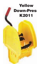
Yellow Down-Press K2011