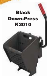
Black Down-Press K2010