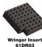
Wringer Insert 61DR03