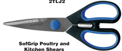
SofGrip Poultry and Kitchen Shears 38X902