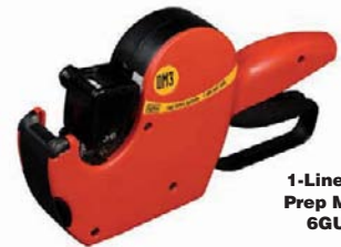
1-Line Food Prep Marker 6GUW4