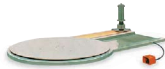
Stretch Wrap Turntable 3KB50