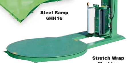
Stretch Wrap Machine 3KB51