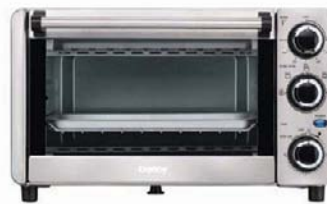
Quarter Size 794HH7

These portable ovens use electrically heated coils and an internal fan to evenly distribute heat to cook food. Higher wattage countertop convection ovens cook food more evenly and faster than lower wattage countertop ovens. Lower wattage countertop convection ovens are more cost-effective. 794HH8 is also an air fryer.