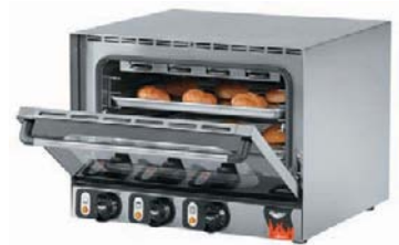
Half Size 4NEA6