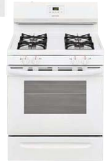
Natural Gas 55KF75