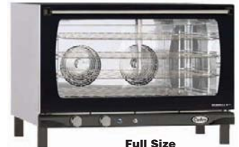
Full Size 11U486