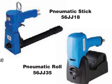
Pneumatic Stick 56JJ18