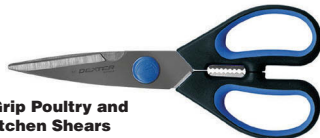
SofGrip Poultry and Kitchen Shears 38X902