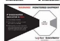
ShockWatch Indicator Companion