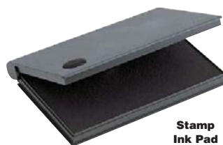
Stamp Ink Pad 1DAA3