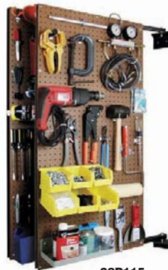
38P115 (Bins and other accessories sold separately.)

Swing panels mount to wall brackets that allow the panels to swing open and closed. Items can be stored and accessed on both sides of the panels, which allows these pegboards to hold more items than standard wall-mount pegboard panels. The swing panels have round holes that accept hooks, toolholders, and other accessories. Multiple panels can be mounted next to each other to expand the storage area. Include wall mounting bracket and hardware.