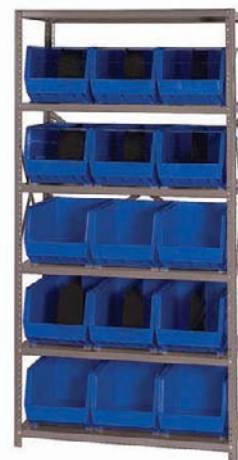
6 Shelf with Hang and Stack Bins E1502