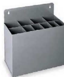
Keystock Rack 3HFK7

6 horizontal compartments hold welding rods to keep them organized and ready for use.