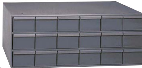
18-Drawer Cabinet 2W265

Revolving storage rack provides convenient access to all sides of storage bins.