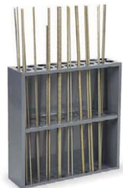
Threaded Rod Rack 3KP91