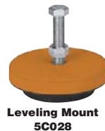
Leveling Mount 5C028

Wedge Jack Mounts —Provide rigid support. Mating parts with spherical seats allow automatic adjustment up to 7° on uneven floors. Through-hole for bolting. 3 1/2" W.