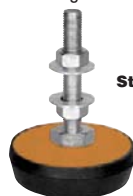
Stud Mount 2LVN5