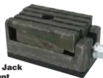
Wedge Jack Mount 2LVN3