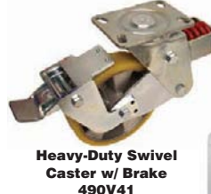
Heavy-Duty Swivel Caster w/ Brake 490V41