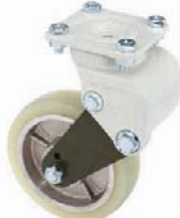
Quiet-Roll Rigid Caster 6JY71