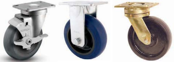
Light-Duty Swivel with Brake 60FD26